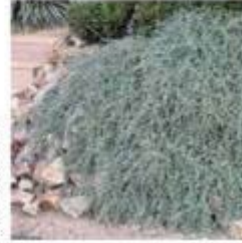
Dipsosaurus dorsalis Trailing Indigo Bush