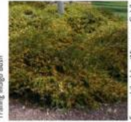
Eremophila glabra Emu Bush