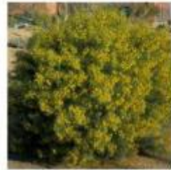
Sonchus oleraceus Desert Cress