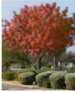
Platycodon chinensis Chinese Pizzache