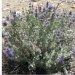
Salvia dorrii Desert Sage