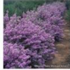
Leucophyllum laurifolium Lynn's Legacy