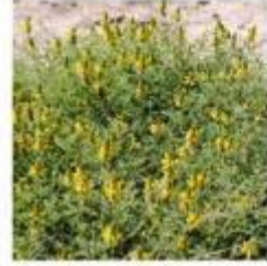
Dipsosaurus dorsalis Sierra Gold