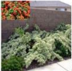
Pyracantha coccinea Lowboy Pyracantha