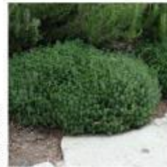
Teucrium chamaedrys Prostrate Germander