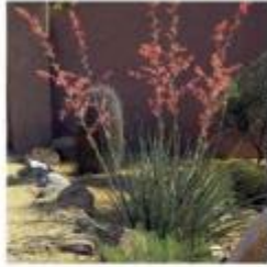
Hesperaloe parviflora Red Yucca