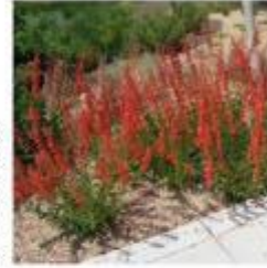
Penstemon eatonii Firecracker Penstemon