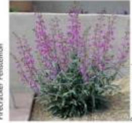
Penstemon parryi Parry's Penstemon