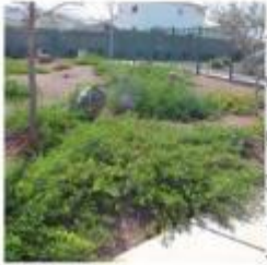
Azadirachta indica Trailing Acacia