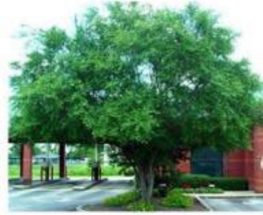
Ulmus parvifolia Chinese Elm