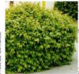
Xylocarpus molle Compact Shiny Xylocarpus