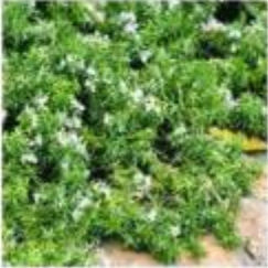
Rosmarinus officinalis Trailing Rosemary