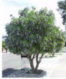
Sophora secundiflora Texas Mountain Laurel