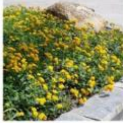
Lantana sp. Golden Lantana