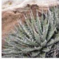
Agave attenuata Nevada Agave