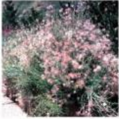
Ficus parvifolia Apache Pine