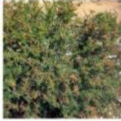
Calliandra eriophylla Fairy Duster